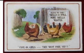
Ex Lot 555