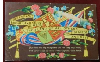
Ex Lot 572