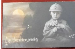
Ex Lot 570