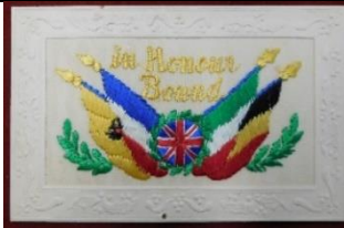
Ex Lot 551