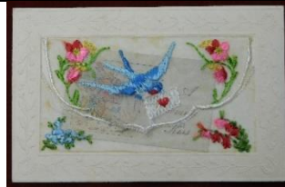
Ex lot 553