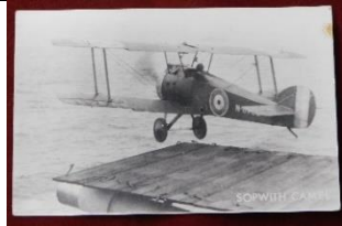
Ex Lot 564